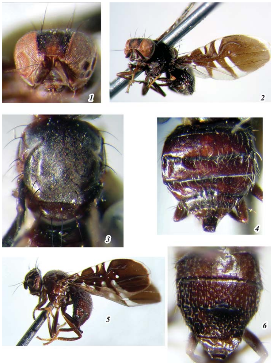
Fig. 2. Cymatosus bestifer (1–4) and C. polymorphomyioides (5, 6): 1 — head, anterior; 2, 5 — total female, left; 3 — mesonotum, dorsally; 4, 6 — abdomen, dorsal view.

Рис. 2. Суматосус бестифер (1–4) и С. полиморфомийоидес (5, 6): 1 — голова, вид спереди; 2, 5 — общий вид самки, слева; 3 — среднеспинка, сверху; 4, 6 — брюшко, вид сверху.